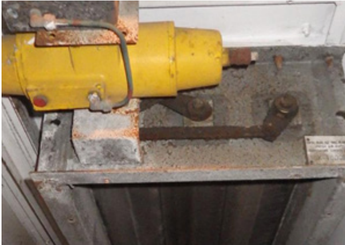
Internal damper corrosion