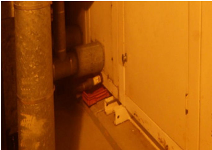
External flooding around cooling coil