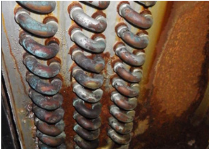
Cooling Coil Corrosion